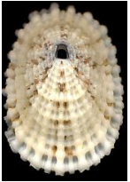
LISTER'S KEYHOLE LIMPET