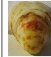
HORSE HOOF SHELLS